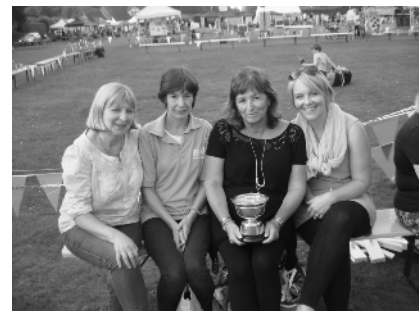
The ladies of Oliver's Battery WI enjoying their success at the Littleton & Harestock Show.