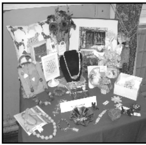
A small selection of beautiful gift ideas

A parcel delivery service is available throughout the year, ensuring your friends and family are able to receive our homemade produce, wherever they are in the country.