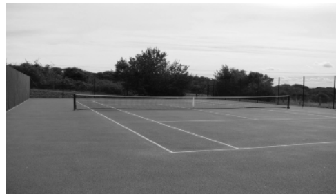
The new tennis court

Any one for Tennis? At long last we now have a tennis court and kick about area. Many of those who have used it have expressed their delight at being able to play tennis in the Parish without having to travel outside the area. We have had a slight problem with the contractor who promised to reseed the surrounding area this Autumn, but the time for sowing grass seed for this year has ended, so it will not be finally finished until next Spring. However, the Woodland Trust have donated 400 small trees that will be planted around the bottom edge of the new area. They are due to arrive in early November, so should be in place before you read this.