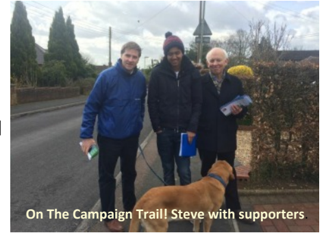
On The Campaign Trail! Steve with supporters

Steve Brine MP for Winchester ~ steve.brine.mp@parliament.uk