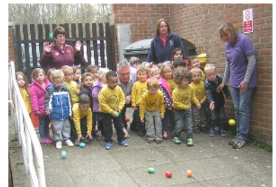
The children enjoy egg rolling!