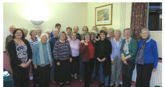
Members of Badger Farm Bridge Club enjoying the celebrations on the occasion of their 30th Anniversary