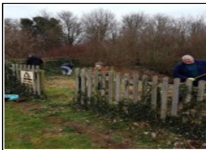
Join us for the next grounds group

Grounds team A group of us met on Sunday morning for a few hours to clear the bottom pond. This had become very overgrown with willow which was draining the pond too early in the summer. We