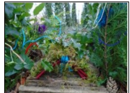
Forest School is a huge hit

children did so well and were fantastic ambassadors for Oliver's Battery School. A huge well done to all the children in choir and a huge thank you to all who have supported choir this year. We are