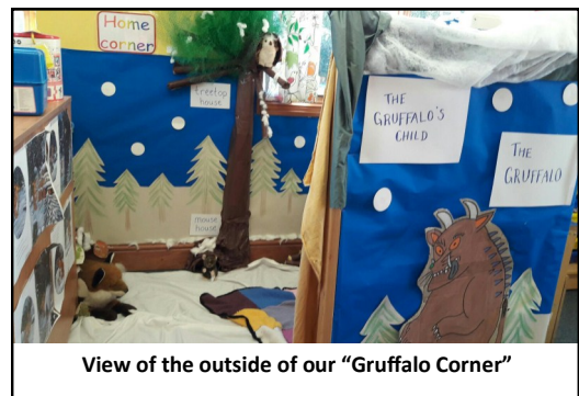
View of the outside of our "Gruffalo Corner"