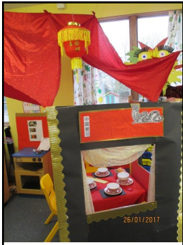
Celebrating Chinese New

As the last of the Christmas glitter and the excitement of our fantastic nativity, held in the school hall and our party attended by Father Christmas, floats away the children have been enjoying their new Spring topic of Growth.