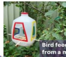
Bird feeder from a milk bottle