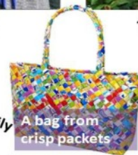
A bag from crisp packets

"Be a designer!" "Get the whole family involved"