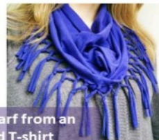
Scarf from an old T-shirt

Can you make something new from waste and join the Re:Design Challenge?