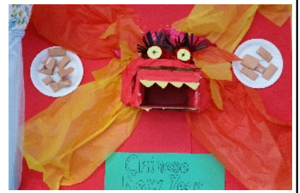
Chinese New Year Artwork from the Pre-School

In February the "home corner" in pre-school was transformed into a Chinese restaurant as the children explored the topic of the Chinese New Year. The children created lanterns, learnt about the Lion Dance and sampled some Chinese food. Other topics the children will have an