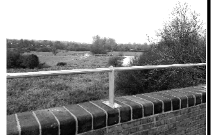
A beautiful view from part of the new Hockley Viaduct.

By the time you read this the new Hockley Viaduct cycle and pedestrian route from Bushfield roundabout to Winchester will be open. The new path goes along the edge of a field in Itchen Farm and then down to the viaduct. There are stunning views over to St Catherine's Hill. The viaduct has been restored and new views opened up as you go along. There is even an old signal to remind us that this was once the Didcot to Southampton railway. The other end of the Viaduct joins to paths along the navigation into Winchester. A great route for young and old, but if you have very young cyclists why not park in the Park and Ride on a Sunday when it is free with no buses to scare young cyclists. A relaxing cycle to the Farmers Market too.