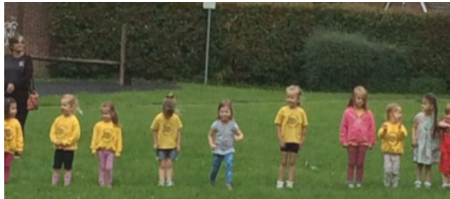
On your marks, get set, go!