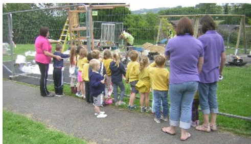
The children inspect with excited interest the building of a new play area on Badger Farm.