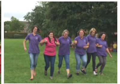
The Staff declare it a tie for first place!