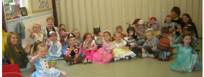
Fancy Dress & Fun at the end of term party!