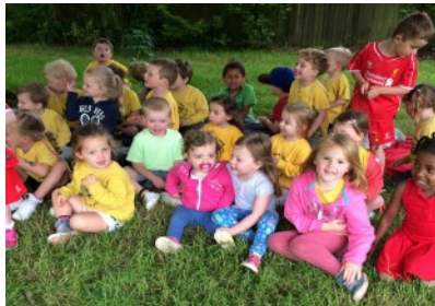
Getting ready for the races!