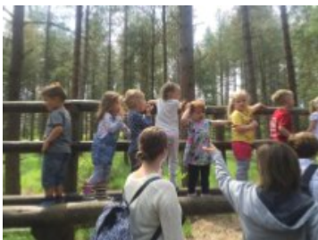
Lots of fun on the outing to Moors Valley Country Park!

We hope you like the selection of photographs below showing the fun.