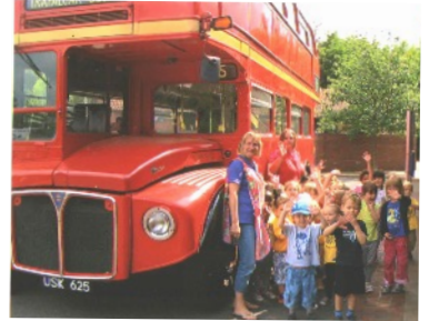
Any more fares please! Badger Farm Pre-School children enjoying the arrival of an old London Bus.

All children are welcome at our group regardless of which school they might attend and this definitely gives a true community spirit. If you would like to find out more about our group then please feel free to pop in and see us in action or contact us on the number in the advertisement below. We look forward to welcoming the new families to our group in September when we resume for another year of FUN!!!